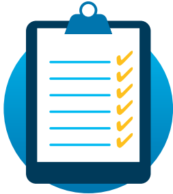
Public Policy User