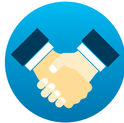
National Or Local Public Client/ Procurer User